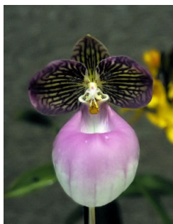
Photos from the March Meeting Show & Tell table Photo mid right Award plant Photos top and bottom right