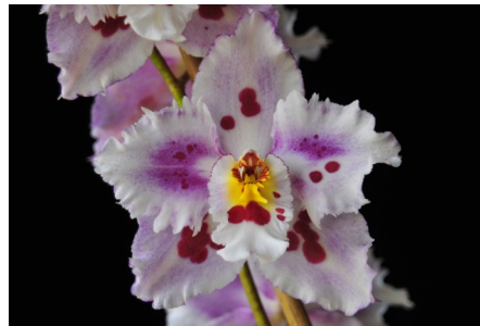
Oncidium owned by Tom Etheridge and Luanne Rolly

Photographer Ross Leach had two very different plants to photograph for their awards. Oncidium (Odontioda) Castle Way 'Humboldt' earned an 82 point AM/AOS for its beautifully colored and presented flowers, and