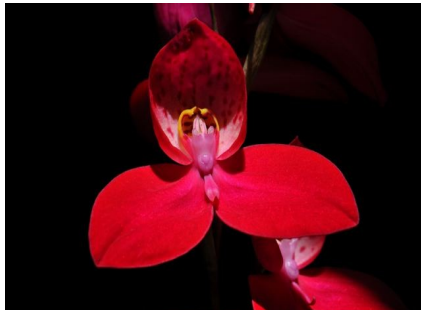
Disa Korean Tiger JO AM/AOS 81 pts.

One might expect fewer plants on a holiday weekend but there were 31 of them for the nine judges and three pre-students to examine. An unusual variety were presented from a multi-flowered Gongora to variegated Neofinitias. The majority were Disas in many colors and sizes from Wally Orchard. Nine plants were nominated and two spectacular red