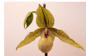
Paphiopedilum Harold Koopowitz