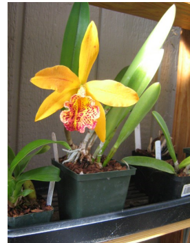
Orchid still happy after power outage

On the first really cold night our power went out around midnight and came back on at 7:30 am. Luckily my greenhouse did not freeze. It has been below freezing at night since, and a snow storm might be on its way. I find having high/ low thermometers very valuable at this time of year. I check it at mid-day so I won't let in too much cold air. I also have a big thermometer in the middle of the greenhouse that I can see from outside. I don't want all my hard work to go to waste by freezing my collection.