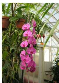
Conservatory of Flowers San Francisco