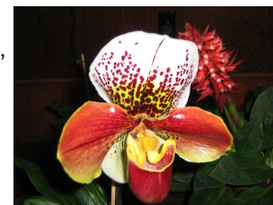
Jim Snyder's orchid Jan mtg

We had low attendance at our first meeting at a new time and place. I hope those of you who weren't there can come next month. Some of those that came found that the Seventh Day Adventist Church is hard to find in the dark, so here are a few tips. It is at 3160 Western Blvd. The major cross streets are 30 th and 35 th . The minor cross streets are Stamm and Poplar. There is a driveway to the right of the church - DO NOT use it; it will take you onto a wet, unpaved area. Pull in on the left side of the church or go to SW Poplar Place, go about half a block and turn right into the back parking lot of the church. The church is on the south side of the road, away from OSU. It is white and set back a little from the road with a line of very dense, tall trees along its west side. The building we are using is separate from the church and at the back of the property. There are no buildings directly across the street from the church.