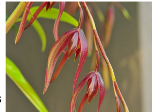
Pleurothallis exalta