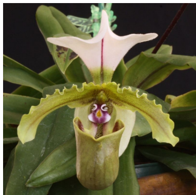
One more.