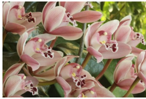
Orchids at home .

Our January meeting program was about orchid conservation. We watched a video presentation about The Orchid Conservation Coalition and their program of 1% Orchid Conservation.