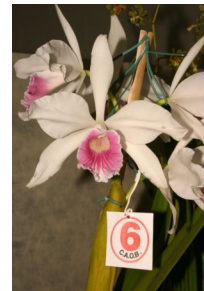
Brasiliaea purpurata var. carnea

Rough guidelines for scoring : Remember, this is very subjective and done without research.