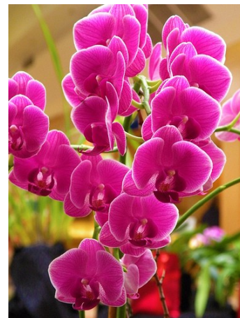
Page 3 MPOS Show Albany