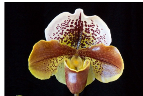
Paph. Don Eggar 'Luanne' HCC/AOS 77 points