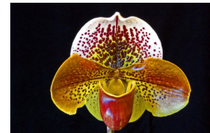
Paph. Luther Pass 'Perfection' AM/AOS 80 points