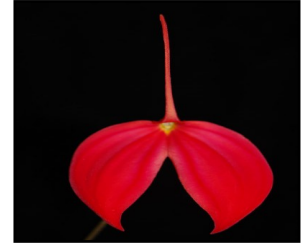
Masdevallia Fraseri 'Regency Fireworks' AM/AOS 82 pts.

Eleven judges and more than twenty-one guests attended the judging or auction on one of our rare, beautifully sunny days. The cherry trees were in bloom with a full complement of bees just outside the Education Building door.