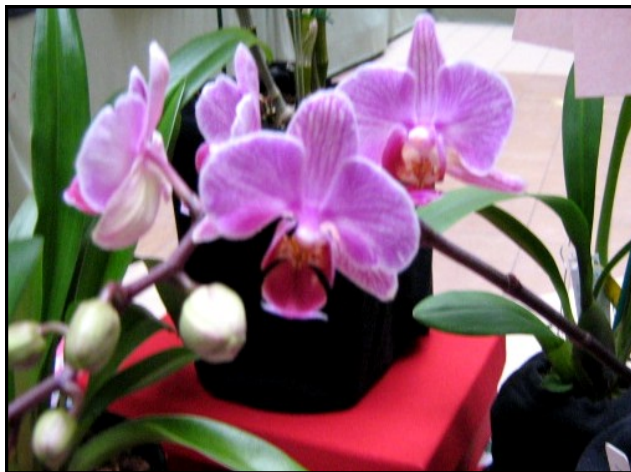
MPOS Show

“A Speaker’s Fee of $25 may not be paid to Board members who provide this service to the Society. A mileage fee of $0.25/mile will be paid to a Speaker or Auctioneer driving to Society activities from outside a 15 mile distance to the meeting site.” The current practice has been to pay speakers a $50 fee and no mileage. Recommended that the rule be changed to reflect current practice.