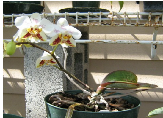
This orchid is in bloom in spite of spider mites, scales, too much sun and wanting a new pot.

This is one of the few times a year when I actually pick up each individual plant so it is also a good time to inspect them. I usually find some insects (scales, mealy bugs, aphids or spider mites) hiding in some corner. When spraying your plants you need to be aware of the damage high afternoon sun and temperatures can cause. Never spray anything if you expect temperatures over 80 degrees. Releasing biological control agents (lacewings, ladybugs or parasitic nematodes) can be a good option. It also reduces pesticide resistance.