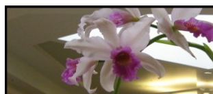
Page 4