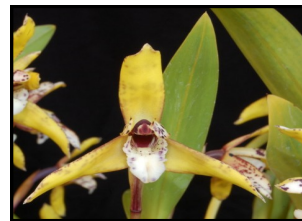
Maxillaria picta 'Vashon' HCC/AOS 77 pts.