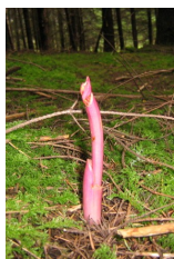
Now that spring is here I have some pictures of the native species. Justina Kelliher