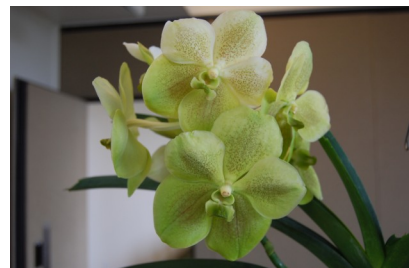
Above: Vanda Roman Empress