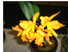
April meeting