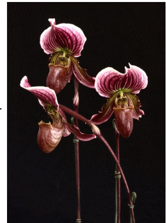
Paph. Faire-Maud