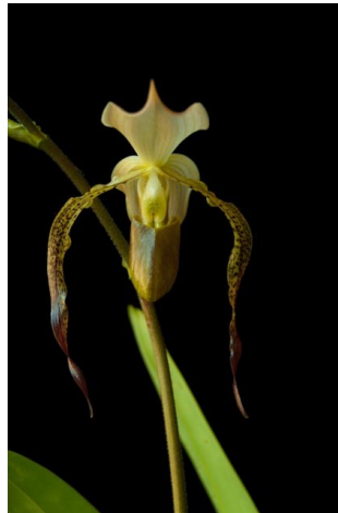
Paph. Frank Booth 'Jonnette'