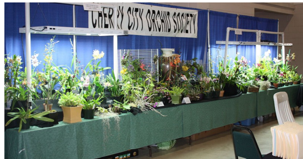
Fabulous job everyone!