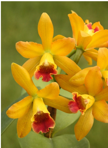
Pictures of picnic grounds at Laurie Nielson's place and of mini catt at Mike's! :-)