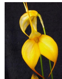
Masdevallia Mary Staal

Volume 17 Issue 9 September 2016 CCOS / MPOS Newsletter 332 24th St NE Salem, Oregon 97301